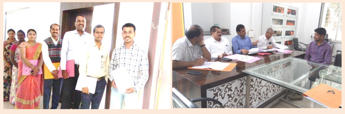
Seed Money Scheme: Applicants and their interviews (2018)