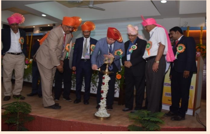
International conference on Chemistry Environment and Energy (16-18th February, 2019)