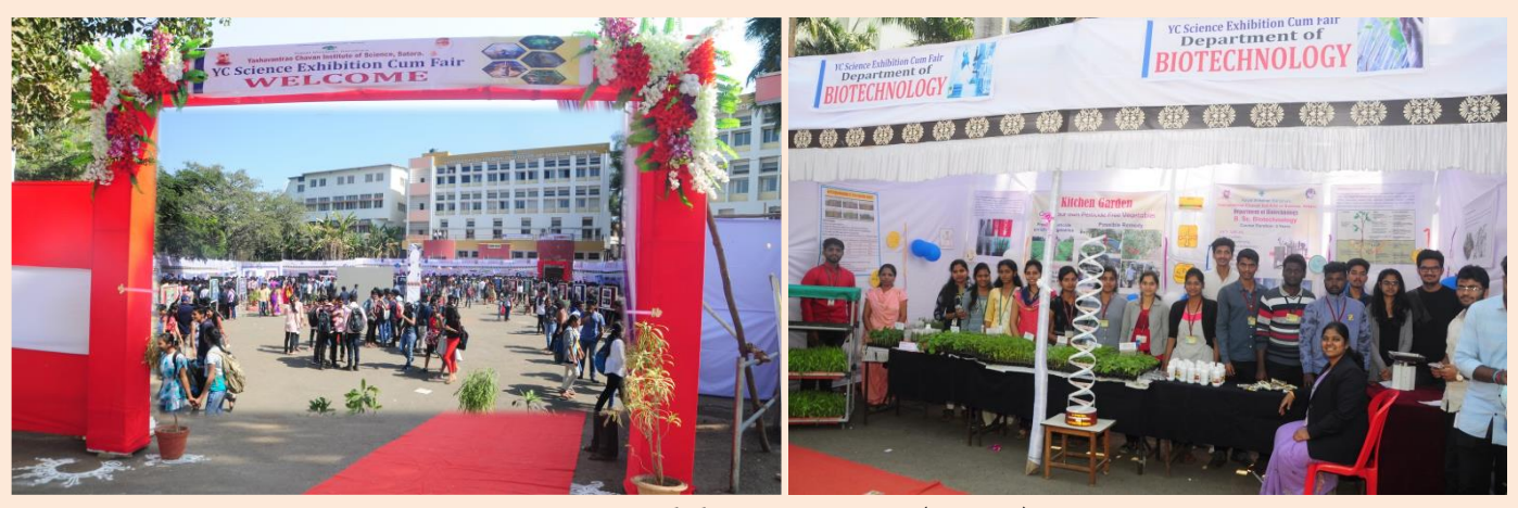
YC Science Exhibition cum Fair (2018-19)