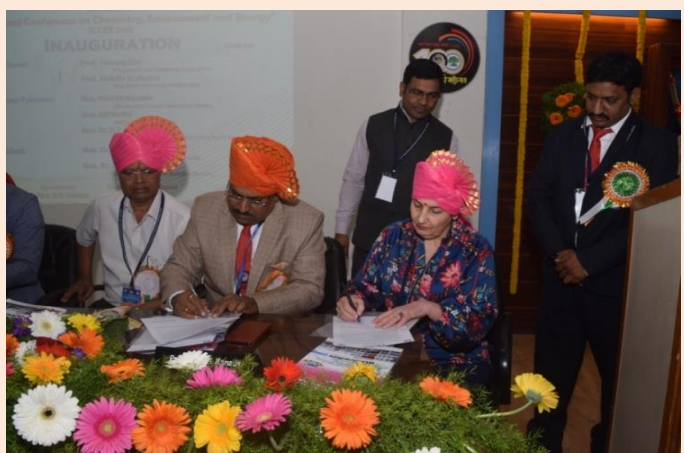
MoU with Bulgarian Academy of Science, Bulgaria