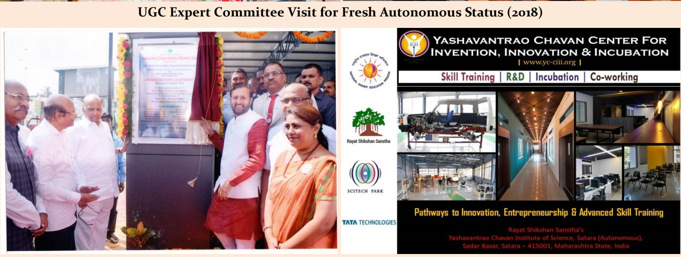
Inauguration of C-III Center (04/10/2018)