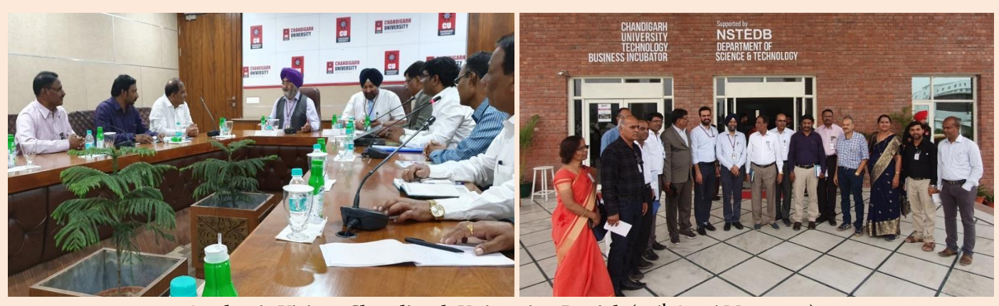
Academic Visit to Chandigarh University, Punjab (20th & 21st May, 2019)